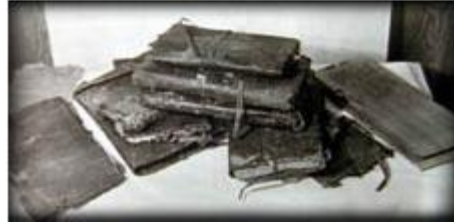
The leather bound codices found at Nag Hammadi