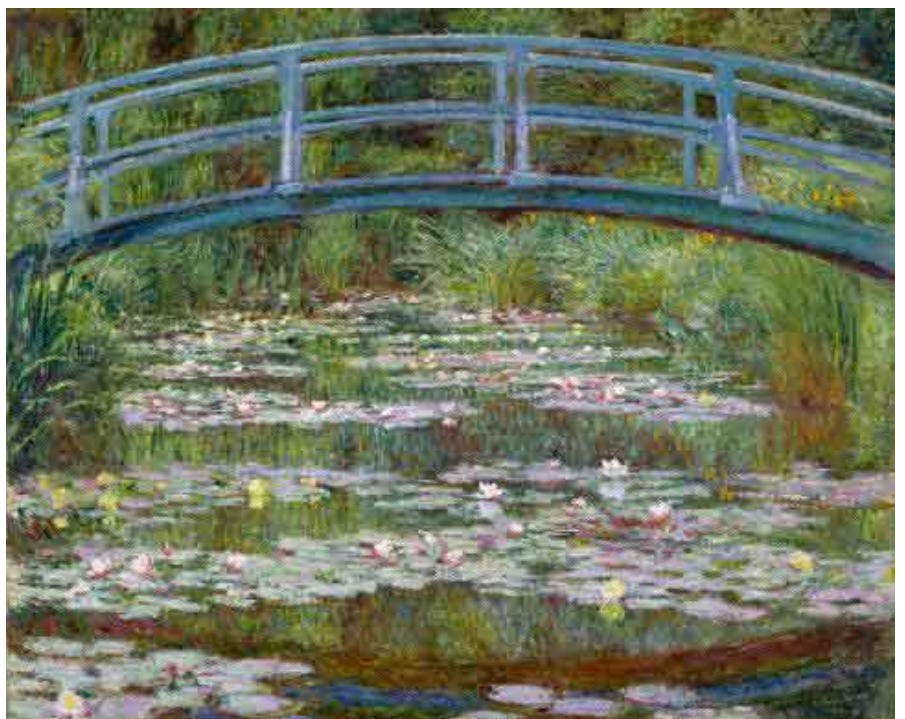
The Japanese Footbridge