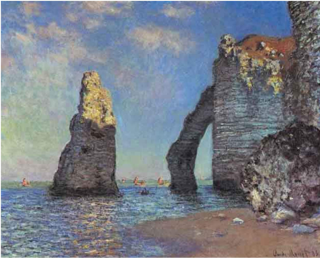
The Cliffs at Etretat