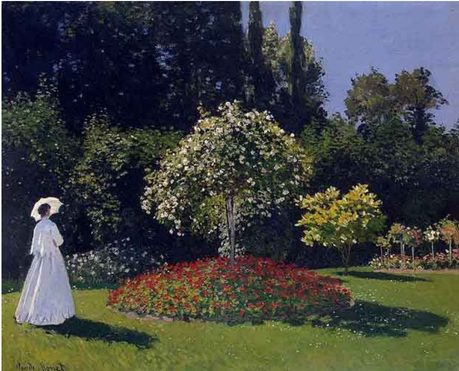
Woman in a Garden

Impressionism was an artistic movement of the late 1800's. The style emphasizes the play of light upon the subjects and focuses on creating an impression of the scene rather than rendering it with photographic precision. Brush strokes are often visible. Claude Monet is widely recognized as an originator of the style and one of its foremost practitioners.