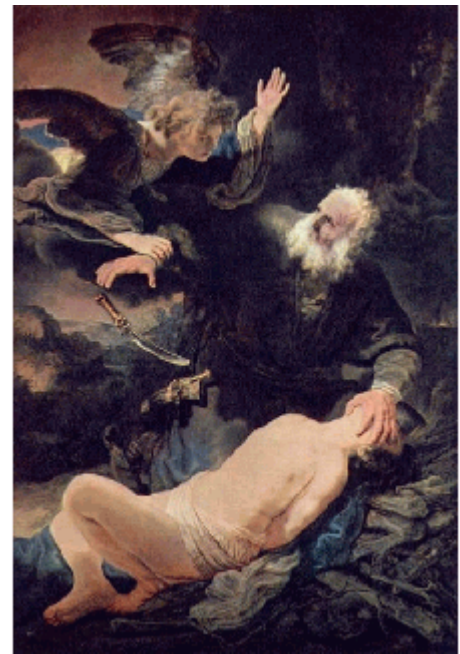
Abraham and Isaac, Rembrandt, 1634

According to the Jewish Torah, Judaism began with the covenant between God and Abraham, believed by many to be the common ancestor of the Jewish people. The story of Abraham is perhaps the earliest known instance of monotheism. The story tells of a man whose faith in God was so great that he was willing to sacrifice his son, Isaac. It is contained within the book of Genesis. Many believe that Genesis was written by Moses (circa 1300 BC), along with four other of the first books of the Hebrew Bible (Tanakh). The story of Abraham is also included in both the Holy Bible and the Qur'an, the sacred books of Christianity and Islam.