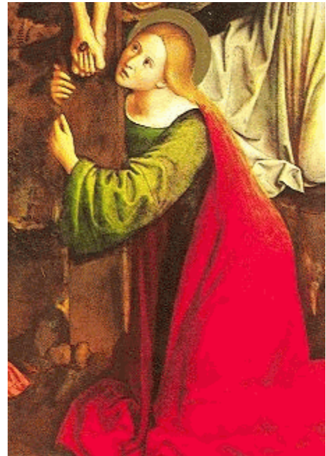
Mary Magdalene with Jesus

The Gospel of Mary is a Gnostic text. Gnosticism was an early form of Christianity. The Gnostics placed a heavy emphasis on the idea that one could find God within the heart. They believed that we could come to know God by profoundly knowing ourselves. The Gnostics conceived of humanity as a divine soul wrapped in a physical body, living in an imperfect physical world. The Gospel of Mary displays an almost Buddhist element, surmising that the transcendence of physical desire leads to spiritual attainment. The text seems to imply that the physical body leads the divine spirit to covet physical desires that distract the spirit from knowledge of its true nature and its home in the kingdom of the heavens. Also evident in the work, the Gnostics seemed more willing than other early Christian groups to see women in positions of spiritual leadership. Though a subject of debate, the Mary referred to in the text is generally thought to be Mary Magdalene.