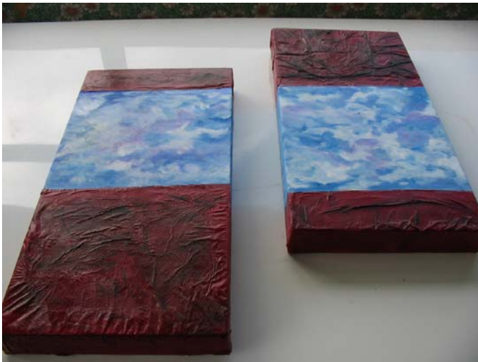
Where Heaven Meets